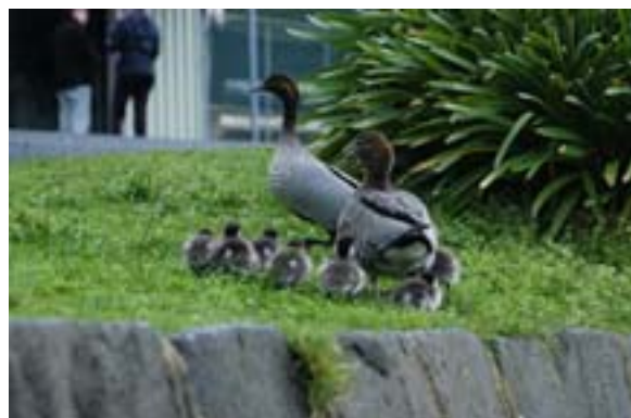
A family of prospective members checking out the facilities at HRC one recent Saturday morning