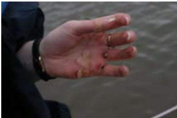
Blood blisters and very raw blisters on a certain member's hand after the Saltwater Classic. Ouch! – and a hint – she wasn't the cox!

It is worth noting that although the crews rowed a total of 9km (to the start and back), the captain and the coach both rode more than twice that distance over some very hilly terrain trying to follow the crews.