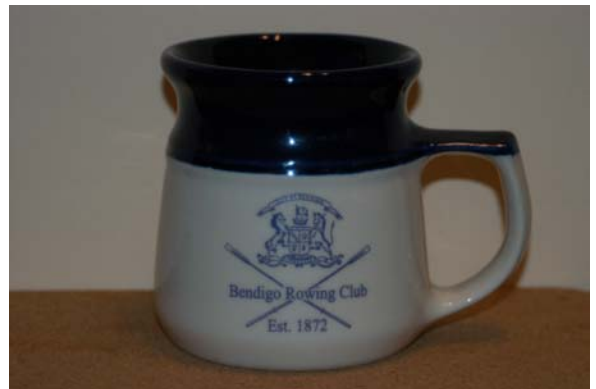
An example of the Bendigo Trophy

The first regatta of the season that HRC is planning to attend is a great one – Bendigo on 23 rd October . This will be the first regatta for the qualifying season, and also is a great opportunity for our new members to experience a regatta outside of Melbourne. The course at approx. 300m would have to be the shortest one on the regatta calendar. I would like to encourage everyone to consider this regatta as a must for the season. In the past they have awarded Bendigo Pottery cups as trophies. Entries are expected to be paid to the captain by 13th October. Flyers will be sent out and posted in the club house as soon as I receive from Bendigo RC.