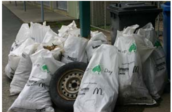
The efforts of HRC