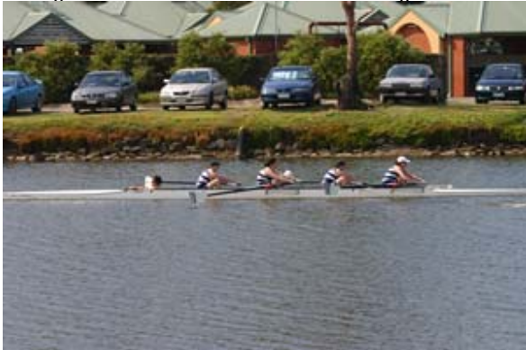
The Women's Masters Four at Footscray