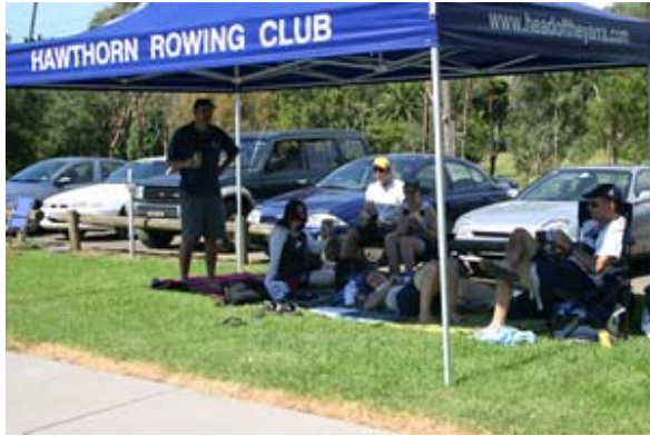
Inaugurated at Footscray