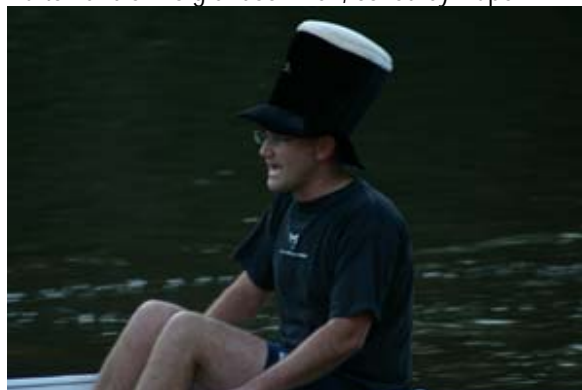
The Captain in the spirit of things with a Guinness Hat!