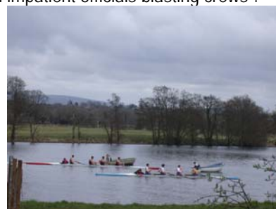
The course at O'Brien's Bridge

that it was a "bush" setting. The start was from anchored tinnies, and listening to starter instructions I could have been at any regatta in Oz with impatient officials blasting crews".