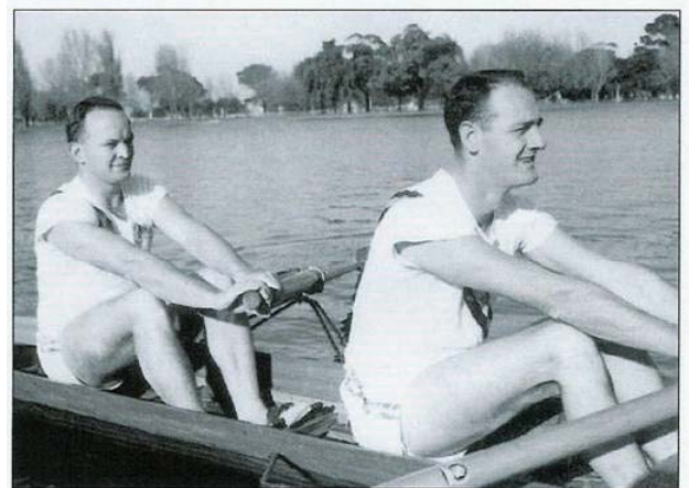
Men's Coxed Pair