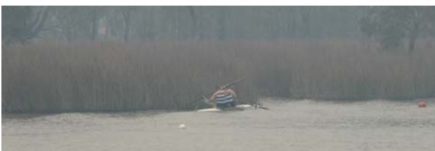
Alan and Josh get lost in the reeds in the coxless pair - must have been the bush fire haze!