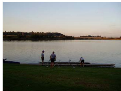
The lake the Viking "boys" call home