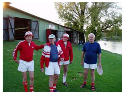
The Viking "boys" in Jo'burg