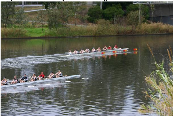
HRC – Riverside Women's Eight well out in front.

All the HRC members combined to make a mixed eight, with an extra Riverside male rower and cox, however the SA crews were too well rehearsed for us!